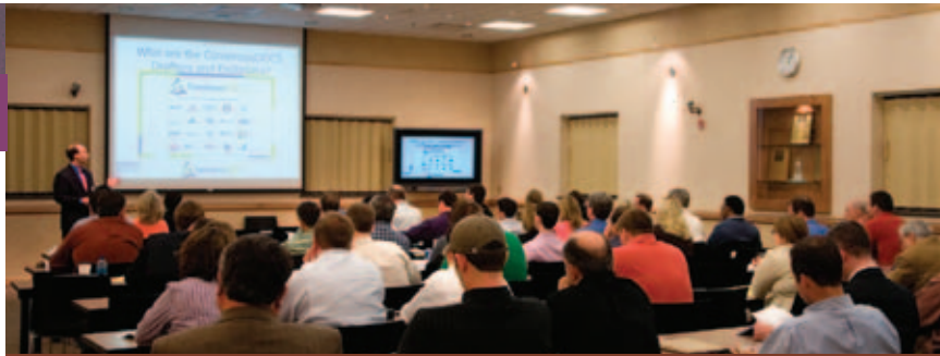
Hutton Conference Center