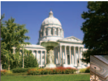
Missouri State Capitol

Our Missouri and Kansas Legislative Bulletins keep members advised of legislative proposals and changes on a timely basis. In addition, through the Builders' Association Political Action Committee (BAPAC), we actively support candidates who share our views on legislation that may be critical to our industry and our members' businesses. Members' voluntary contributions to BAPAC help raise our legislative profile and make our goals easier to achieve.