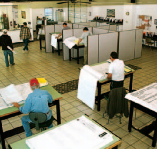
The Builders' Association Plan Room in Springfield, Missouri

With the DPE, you can reduce your printing, copying, faxing, and shipping costs dramatically. Perhaps best of all, it is affordable and easy to use.