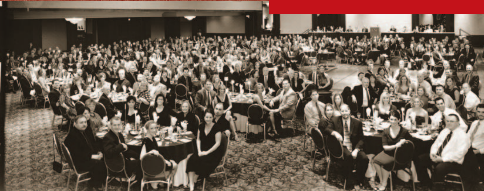
Builders' Association Anniversary Banquets, an annual tradition, feature distinguished speakers and guests and are attended by hundreds of our members.