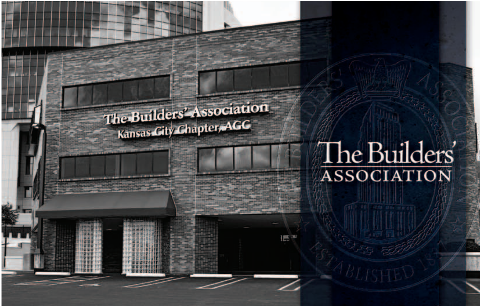
The Administrative Offices of The Builders' Association and Kansas City Chapter, AGC in downtown Kansas City, Missouri